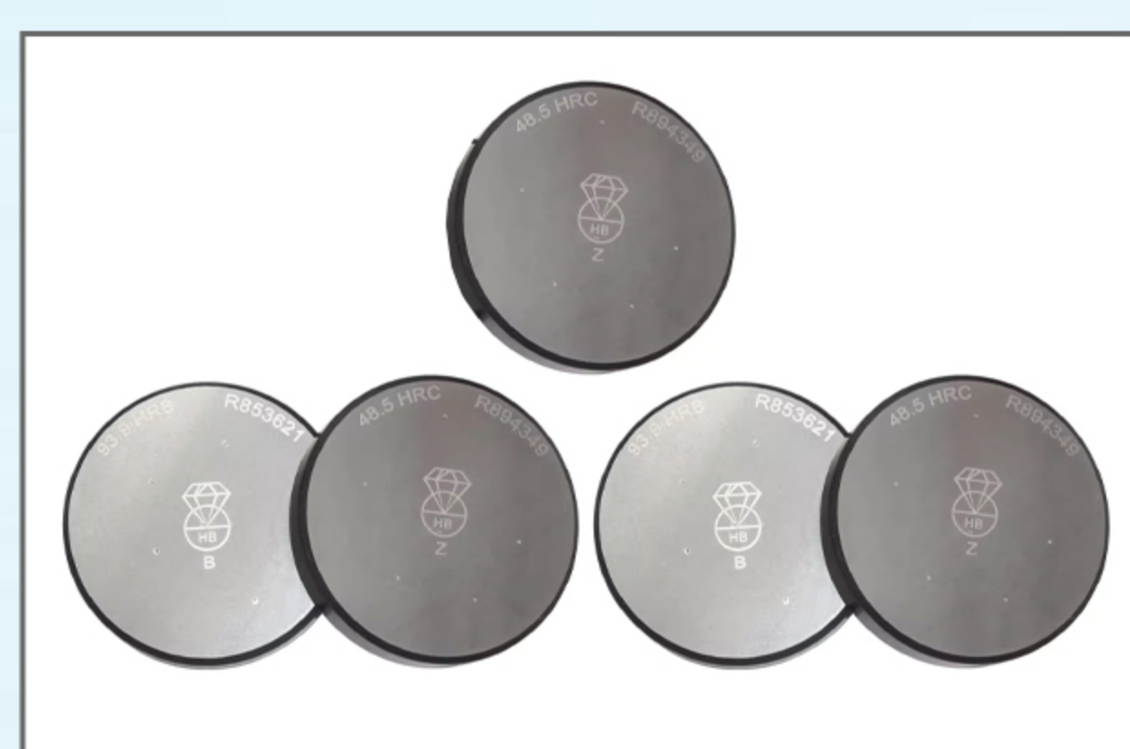
Standard hardness block