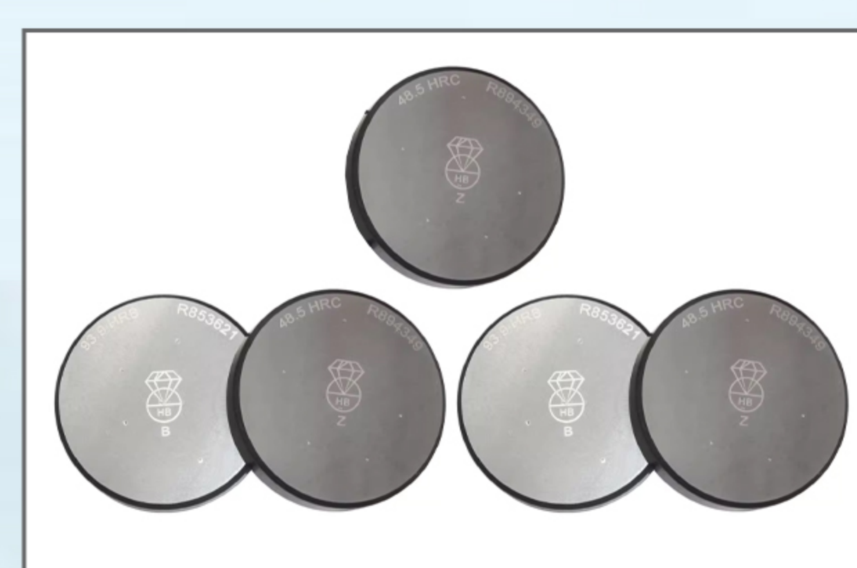
Standard hardness block