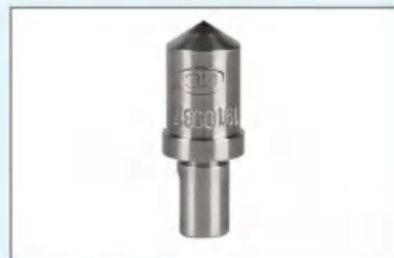
Diamond Rockwell indenter