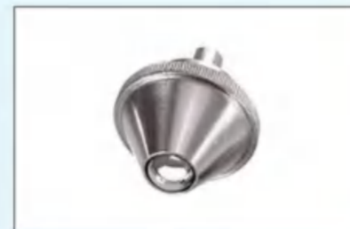
Steel ball \phi 1.588mm indenter