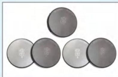
Standard hardness block