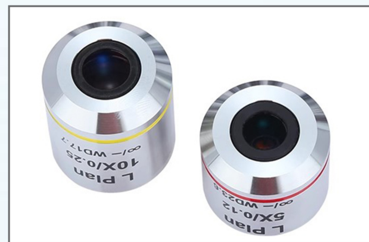
Objective (2.5X, 5X)