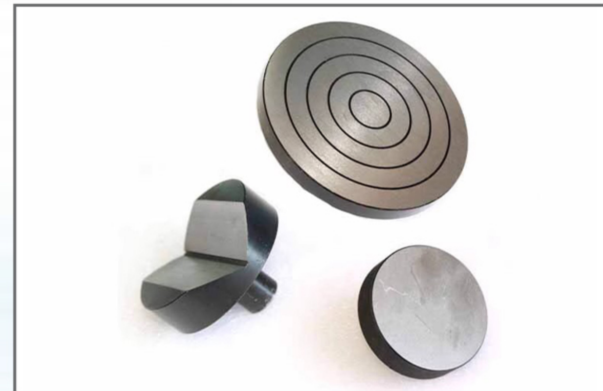
Large, medium, V-test table