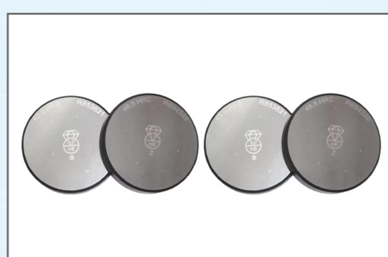
Standard hardness block