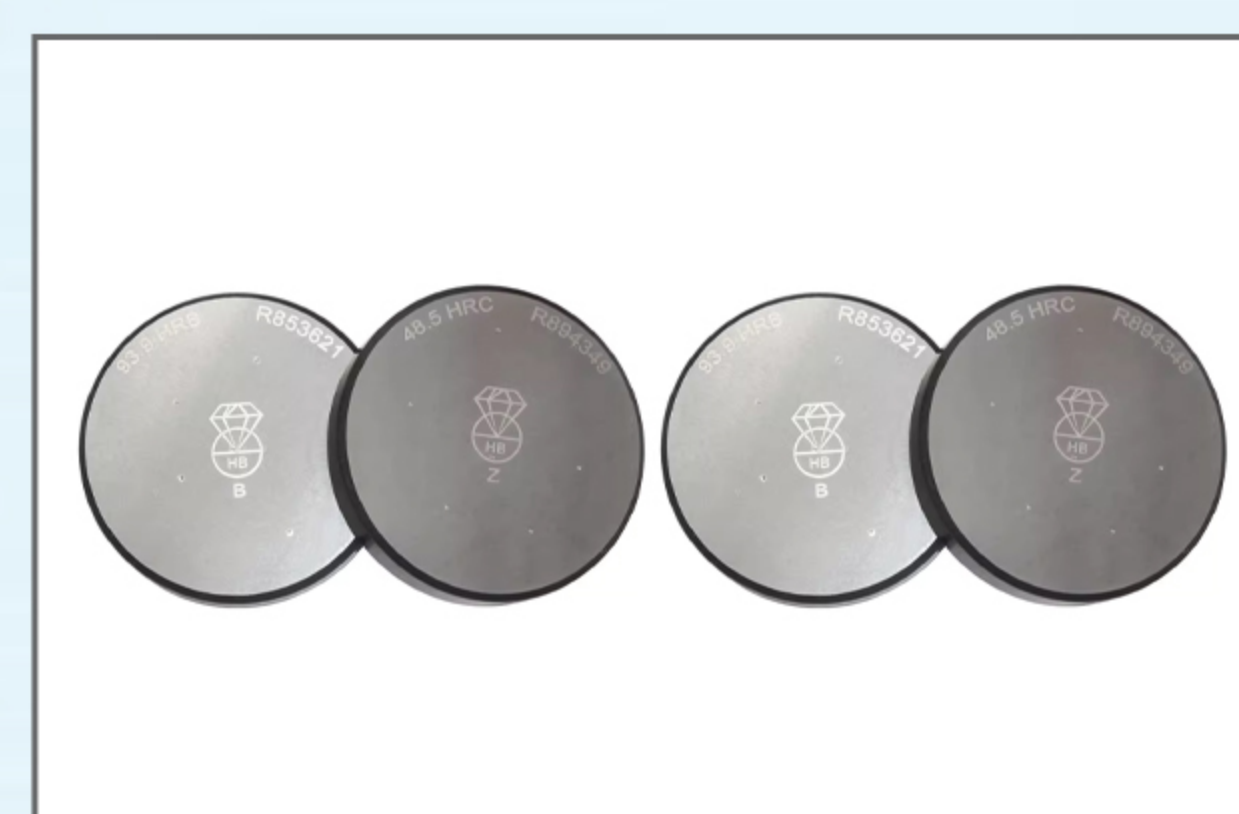
Standard hardness block