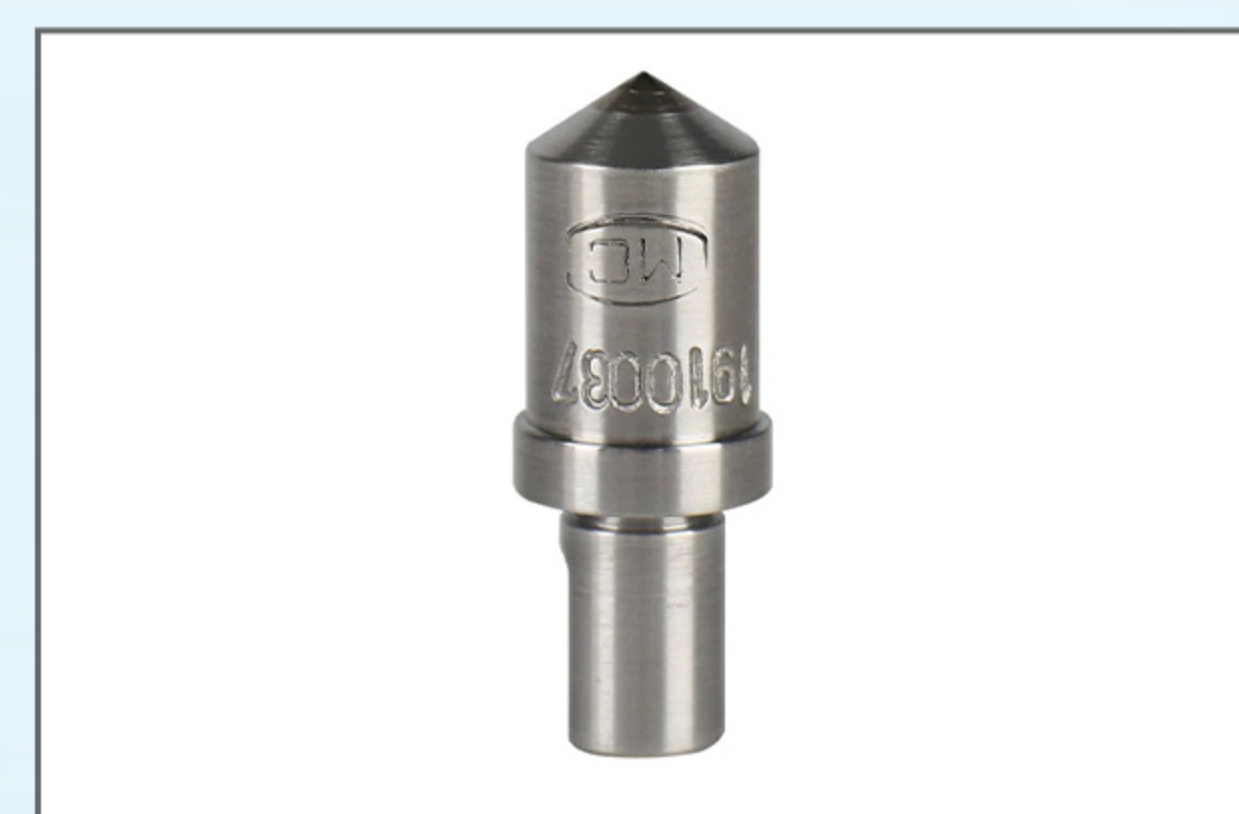
Diamond Rockwell indenter