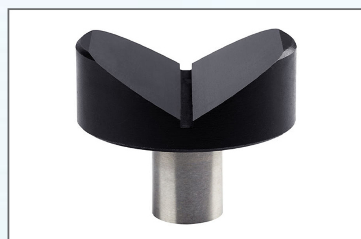
V-shaped testing table