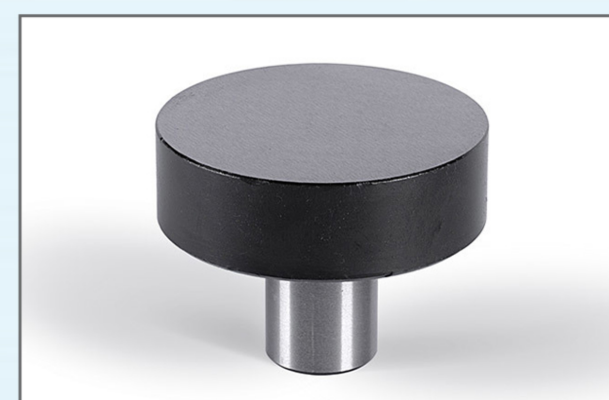
Medium testing table