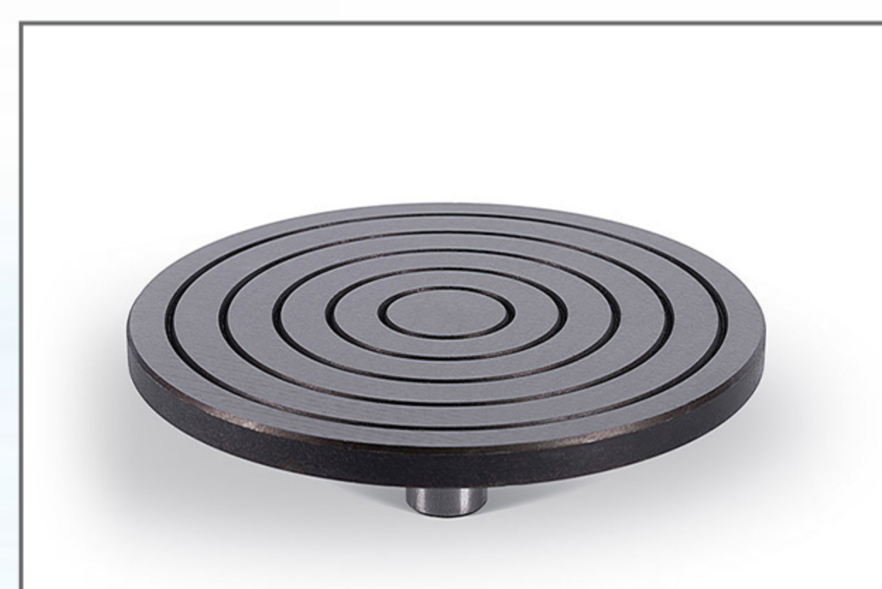
Large testing table