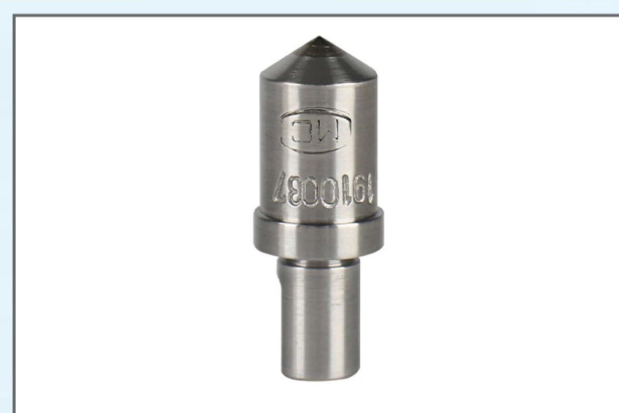
Diamond Rockwell indenter