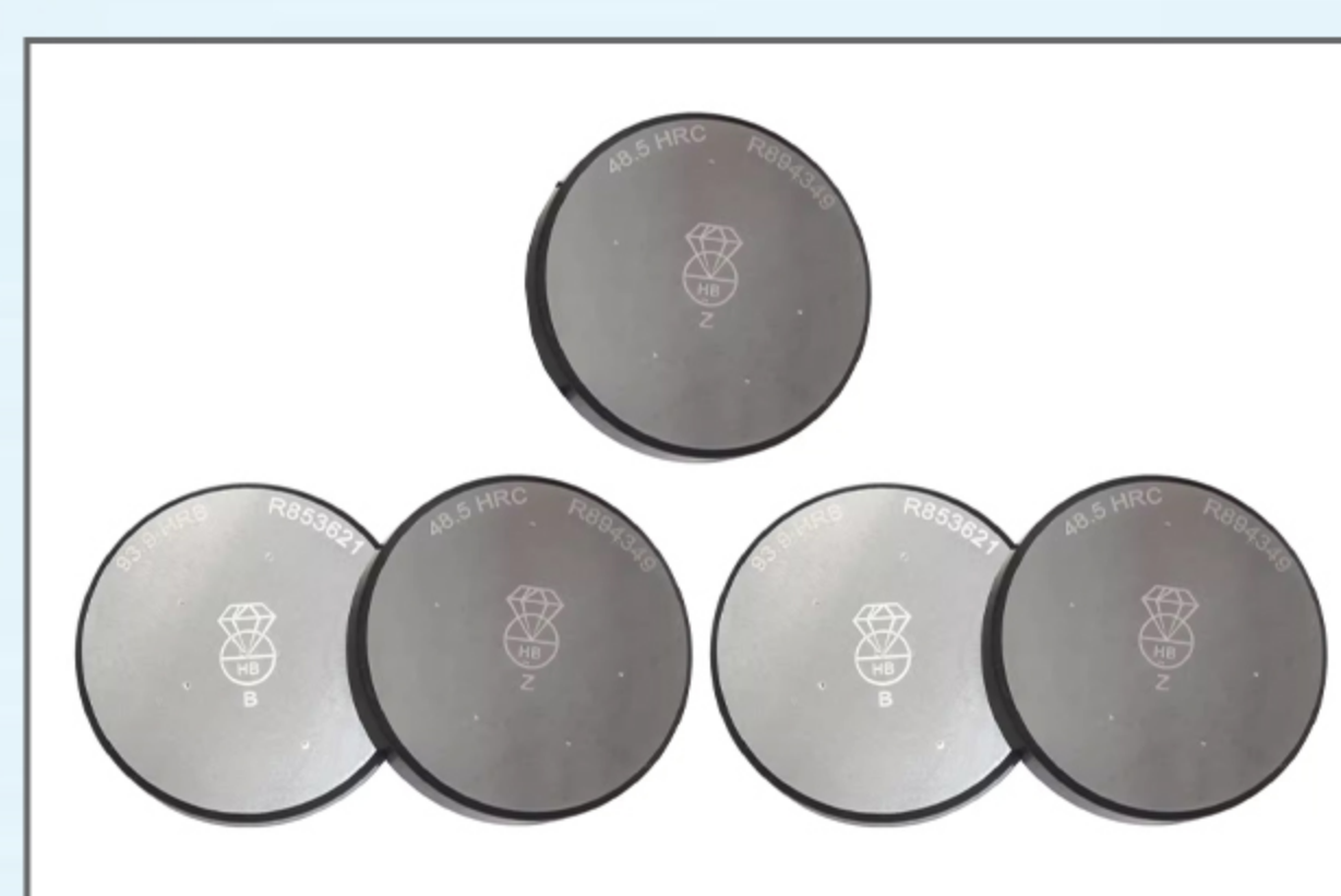
Standard hardness block