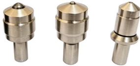
Rockwell steel ball indenter