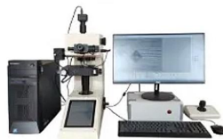
HTMV-W CCD Vickers Hardness testing Software