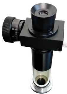
KASON Brinell microscope