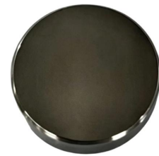
Hardness Test Block