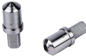
Diamond Vickers Indenter