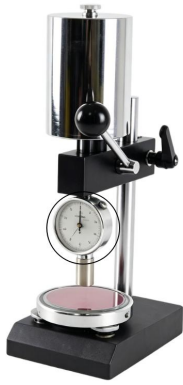
Shore Hardness Test Stand